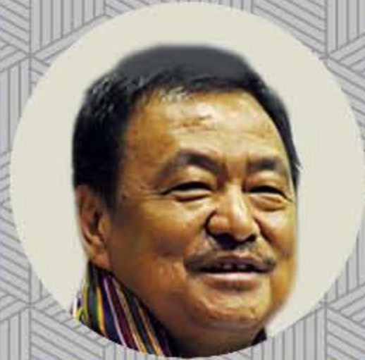
Mr. ZANGLEY DUKPA

FORMER MINISTER OF HEALTH, EX VICE CHANCELLOR ROYAL BHUTAN UNIVERSITY, BHUTAN