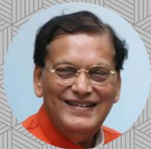
PADMABHUSHAN Dr. BINDESHWAR PATHAK

EX VICE CHANCELLOR GUJARAT AGRICULTURE UNIVERSITY, CHAIRMAN -ICFA, INDIA