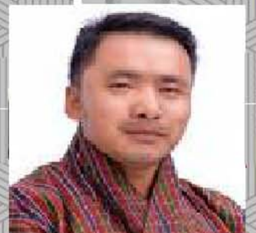
LYONPO UGYEN DORJI

HON'BLE MINISTER FOR LABOUR & HUMAN RESOURCES, GOVT. OF BHUTAN