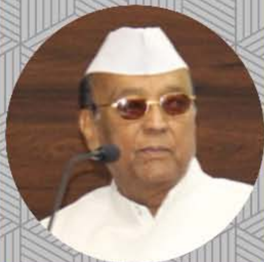
SHRI SAYED SIBTEY RAZI

FORMER MINISTER OF HEALTH, EX VICE CHANCELLOR ROYAL BHUTAN UNIVERSITY, BHUTAN