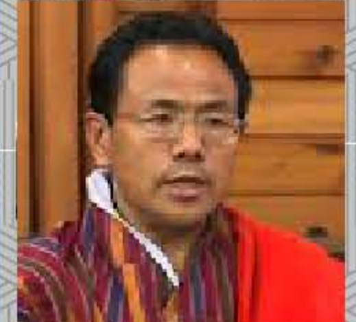
LYONPO NORBU WANGCHUK

HON'BLE MINISTER FOR LABOUR & HUMAN RESOURCES, GOVT. OF BHUTAN