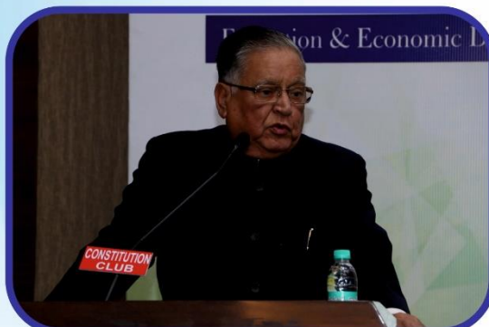
Lt. GENERAL K M SETH HON'BLE FORMER GOVERNOR OF CHHATTISGARH, MADHYA PRADESH & TRIPURA