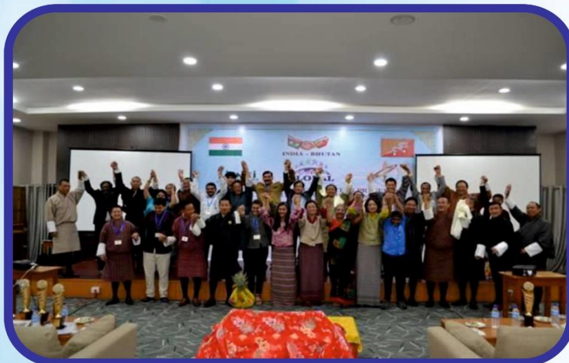
INDO-BHUTAN FRIENDSHIP SUMMIT, THIMPHU, BHUTAN 25 TH TO 28TH JUNE 2017 – JOINING HANDS FOR BETTER TOMORROW & PEACE IN SOUTH ASIAN REGION.