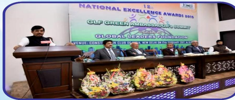
Mr. SHAHNAWAZ HUSSAIN, FORMER AVIATION MINISTER, GOVT. INDIA ADDRESSING THE SEMINAR.