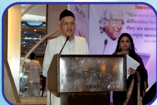
SHRI BHAGAT SINGH KOSHYARI HON'BLE GOVERNOR OF MAHARASHTRA