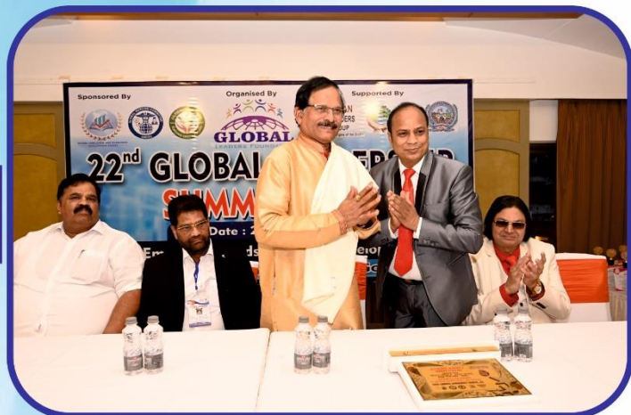
WELCOME CHIEF GUEST - SHRI SHRIPAD NAIK HON'BLE MINISTER OF STATE FOR TOURISM AND PORTS, SHIPPING & WATERWAYS (GOVT. OF INDIA).