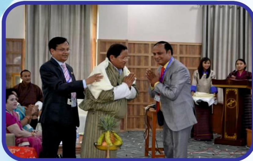
WELCOME CEREMONY – Dr. KINZANG DORJI, FORMER PRIME MINISTER OF BHUTAN AT INDO – BHUTAN FRIENDSHIP SUMMIT, THIMPHU ON 25TH TO 28TH JUNE 2017.