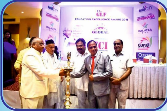
LAMP LIGHTING CEREMONY - SHRI BHAGAT SINGH KONSHIYARI, HON'BLE GOVERNOR OF MAHARASHTRA & FORMER CHIEF MINISTER OF UTTRAKHAND ALONG WITH OTHER DIGNITARIES.